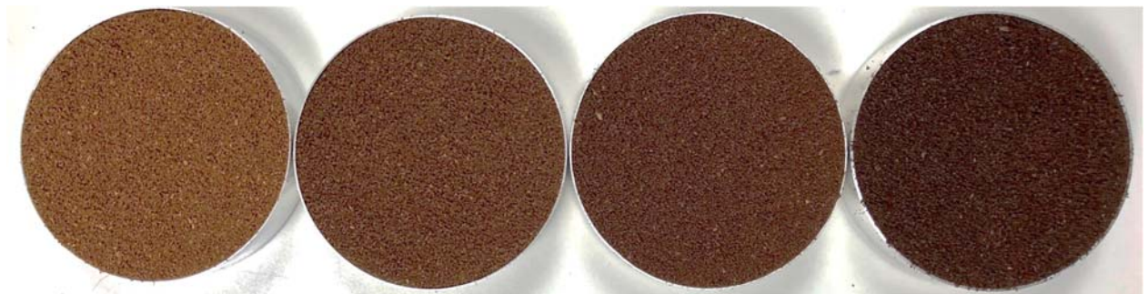
Figure 4 shows Moisture and DOR values obtained from 4 different samples of ground coffee ranging from light to dark roast.