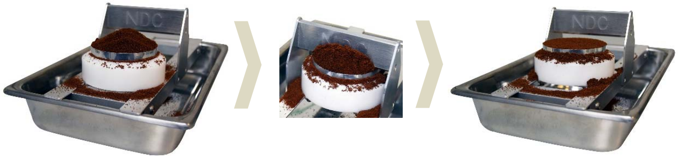
Figure 3: Sample levelling device

for ground and soluble coffee, a sample levelling device is provided. The operator simply overfills the sample dish which is then pushed under the leveling bar to create a flat surface as shown in Figure 3.