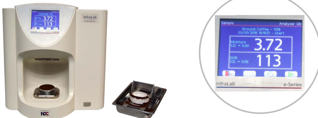
Figure 1. InfraLab at-line moisture analyzer